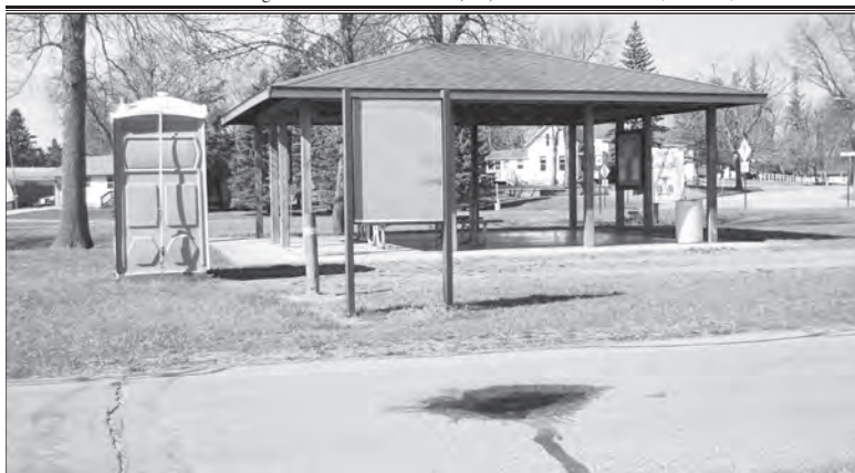
TRAIL SHELTER With the weather getting warmer and the snow gone, hopefully for a while, it is time to get out and enjoy the outdoors. Above is the shelter on the Central Lakes Trail in Evansville. There are shelters in the towns the trail runs through, including Brandon and Garfield.

Delivered free each week in Brandon, Evansville, Garfield, Millerville, and Alexandria • wrecord@gctel.com 2026 No. 17 • For advertising rates and information call (320)834-4924 • P.O. Box 86, Brandon, MN 56315 • Thursday, April 30, 2026