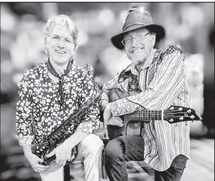
Members of the group Groovy Shoes.

Evansville Art Center is located at 111 Main Street in Evansville and is handicap accessible.