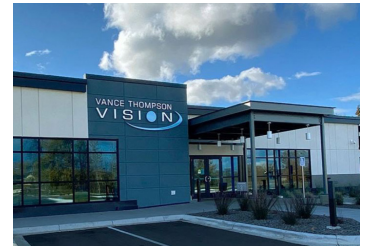
2600 Jefferson St., Alexandria, MN

With advanced treatments from LASIK and cataract surgery to glaucoma and oculoplastics and a team that treats every patient like family, Vance Thompson Vision truly is your trusted destination for eye care.